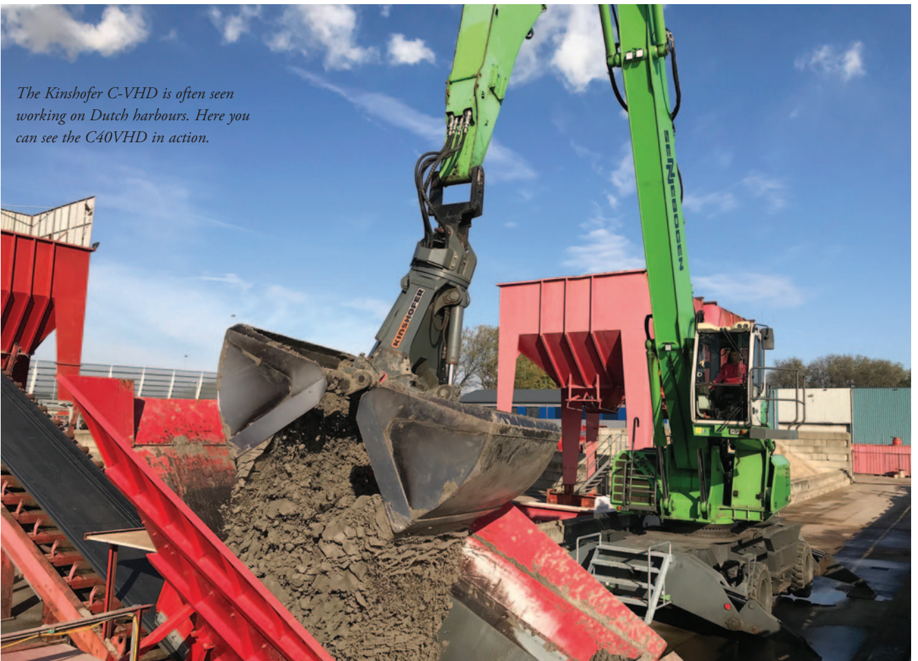
The Kinshofer C-VHD is often seen working on Dutch harbours. Here you can see the C40VHD in action.