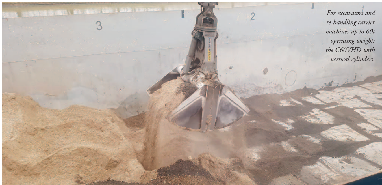
For excavators and re-handling carrier machines up to 60t operating weight: the C60VHD with vertical cylinders.

For 50 years now, Kinshofer GmbH has been a major manufacturer of high-quality attachments for truck mounted cranes and it is now on the way to becoming one of the most respected excavator attachment producers worldwide, too. In the last two decades, KINSHOFER has become more and more interesting for the re-handling business, producing large re-handling clamshell buckets (C-Series) for excavators and carriers with an operating weight from 18 tonnes of up to 100 tonnes as well as smaller ones for loader cranes.